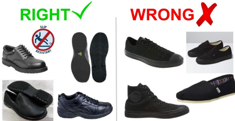
Figure 1: Shoes