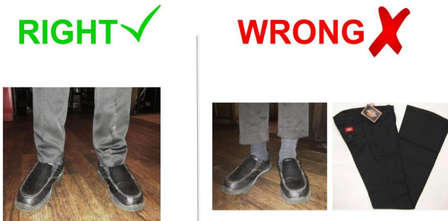
Figure 2: Pants