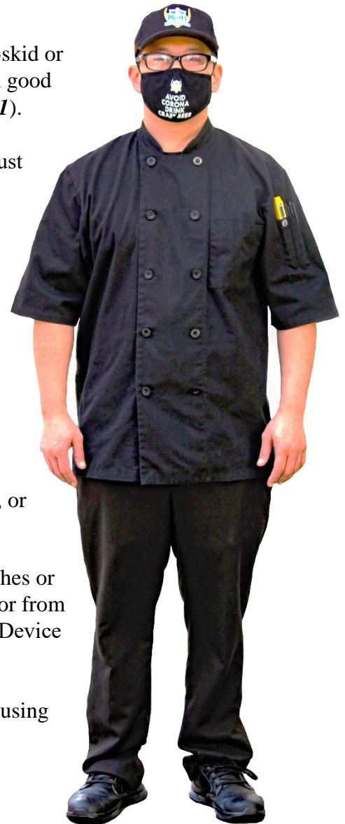
Figure 5: Kitchen Staff Uniform